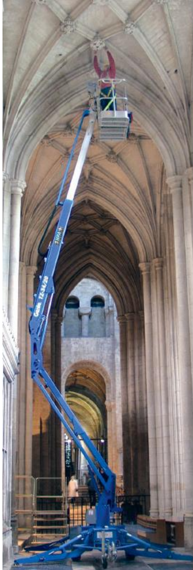
Genie TZ-34/20 trailer-mounted boom working at Winchester Cathedral